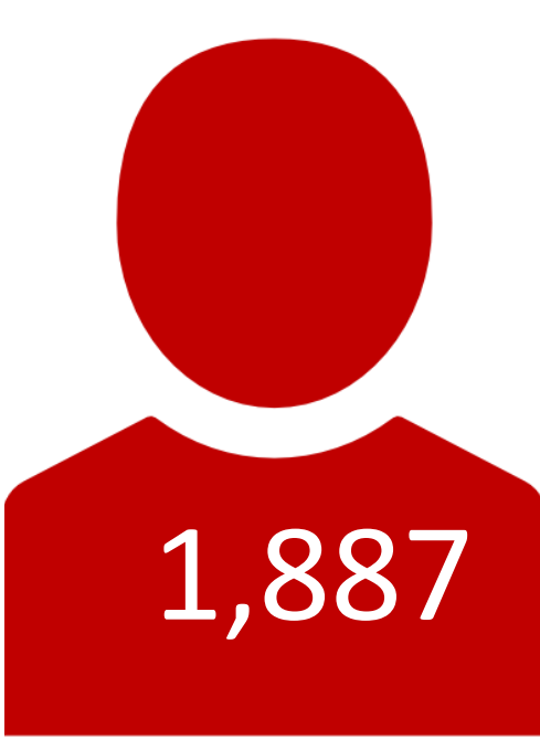
Individuals with Physical Disabilities